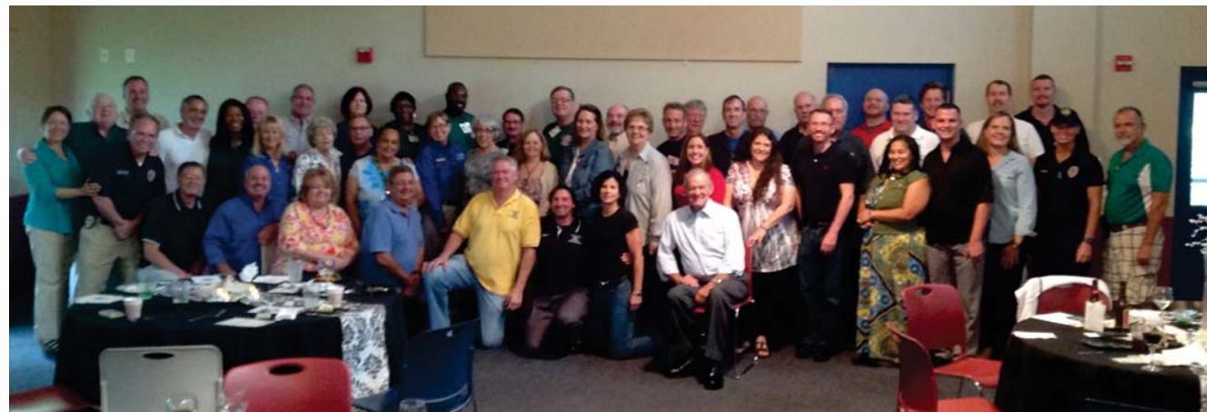
Volunteer Appreciation Event, March 2014

The Wilton Manors Community Affairs Advisory Board (CAAB) has announced the call for nominations for its first-ever Community Spirit Awards . This new effort will recognize one outstanding volunteer and one business in Wilton Manors for outstanding volunteer service.